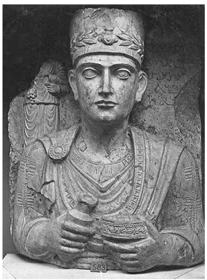
Fig. 4. Loculus relief depicting a priest and a child, British museum (inv. n. BM 125033) (photo: Raja 2016: fig. 1).