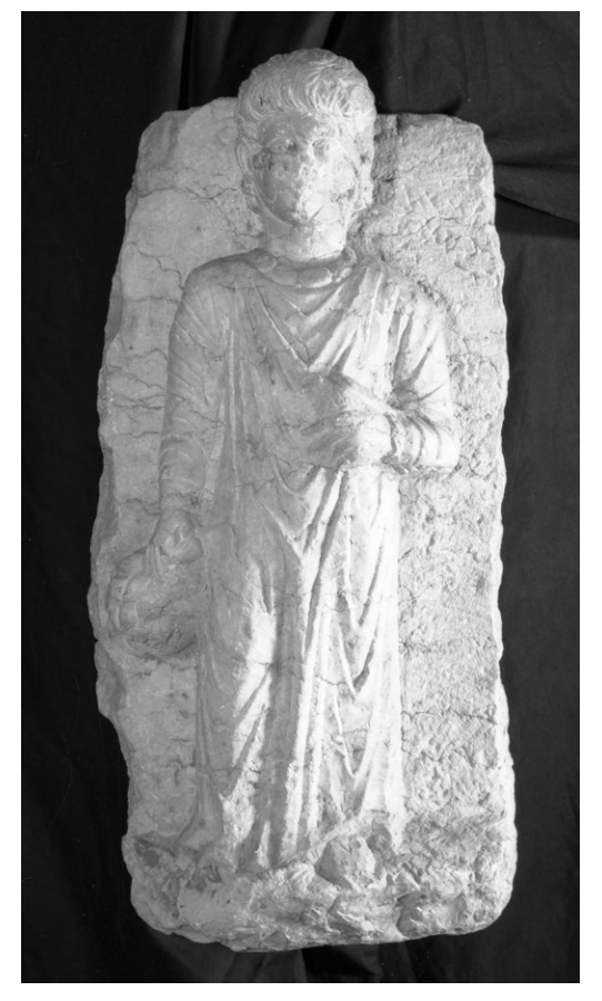
Fig. 3. The funerary stela of a Palmyrene girl from National Museum in Belgrade.