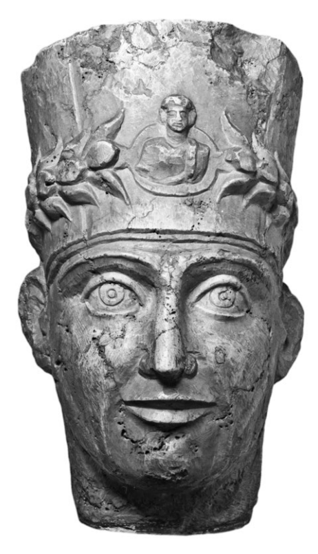
Fig. 1. The head of a priest from National Museum in Belgrade.

monuments were gifts or were bought off by National Museum, both monuments with priestly presentations were found in the area of the Belgrade fortress (Ibid: 75). Two monuments with priests' representations were mentioned in the H. Ingholt publication "Studier over palmyrensk Skulptur" from 1928 and from that period on, they were described in other publications in the catalogue form (Mirković & Dušanić 1976: n. 72, 85–86). As for the third Palmyrene monument, funerary stela with the representation of a girl holding a bird and grapes in her hands, it was only published in I. Popović' article in which the context of finding of Palmyrene monuments from National Museum in Belgrade, is discussed.<sup>3</sup>